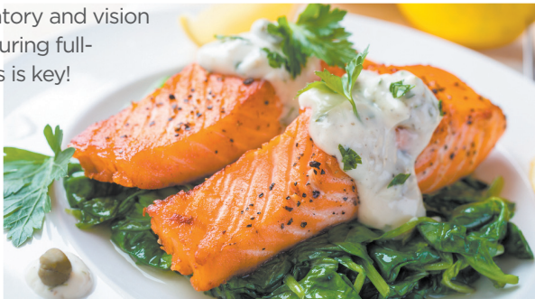
PAN-ROASTED SALMON WITH SAUTÉED BABY SPINACH