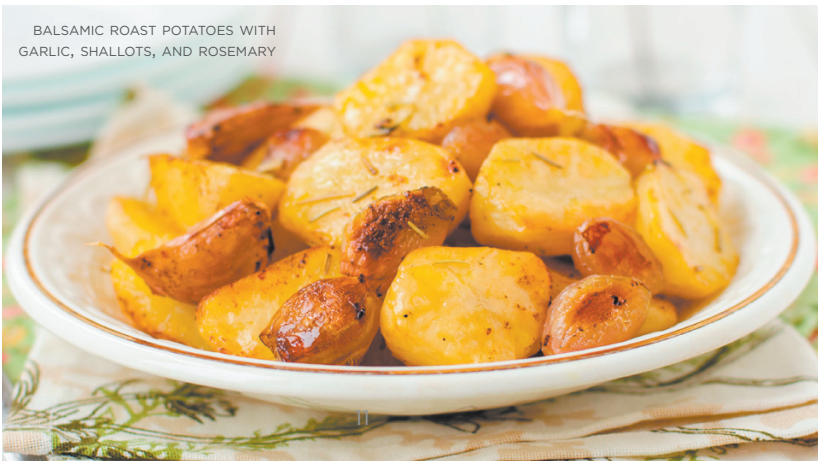
BALSAMIC ROAST POTATOES WITH GARLIC, SHALLOTS, AND ROSEMARY