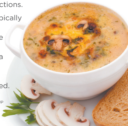
ROASTED MUSHROOM SOUP