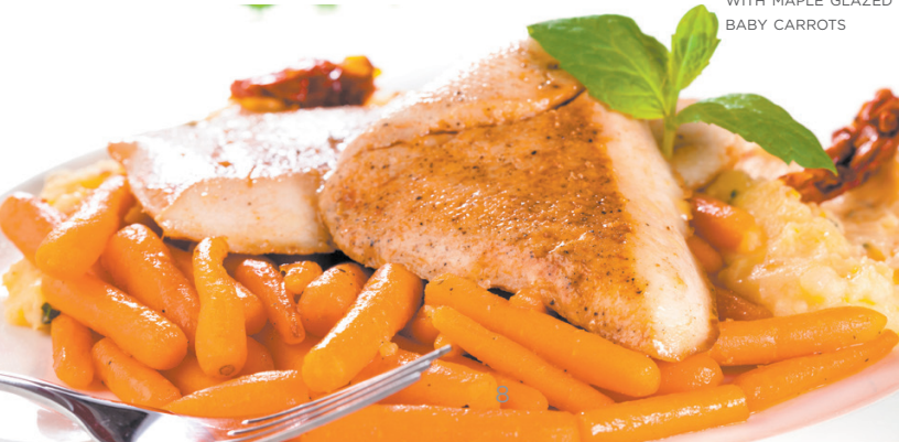
GRILLED TUNA STEAKES WITH MAPLE GLAZED BABY CARROTS

Bonus benefit: Carotenoids are also antioxidants, so not only do they add color to your skin, they also protect you from free radical damage, the main cause of premature skin aging.