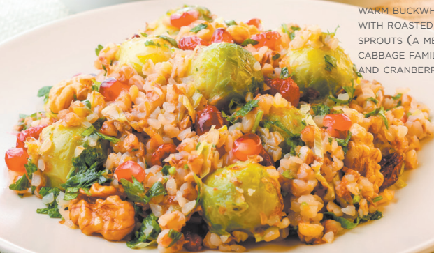
WARM BUCKWHEAT SALAD WITH ROASTED BRUSSELS SPROUTS (A MEMBER OF THE CABBAGE FAMILY), WALNUTS, AND CRANBERRIES

Cranberries: Cranberries have such a high nutrient and antioxidant content they are sometimes considered a “superfruit.” Cranberry concentrate can help prevent and treat urinary tract infections, while fresh cranberries support oral health, decrease blood pressure, and slow the growth of cancer. And a half-cup has only 25 calories.